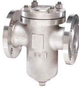
Model 150BFSSB1 – Stainless Steel